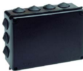
Cones for glands*