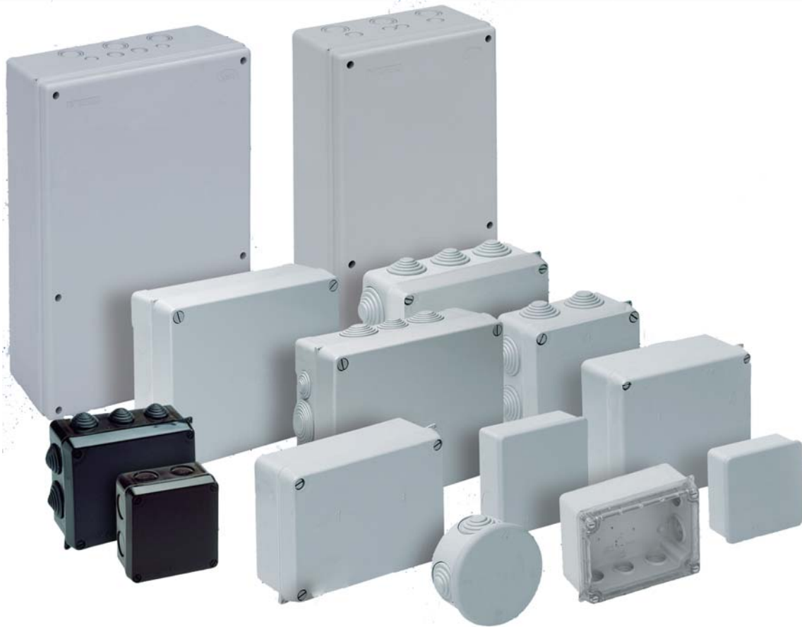
Different cover heights*