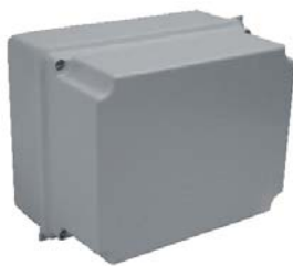
DIN rail 35 mm*