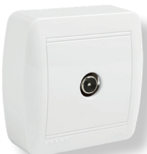
MUR94U. TV connector.