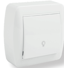
MUR04U. Light push button.