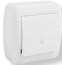
MUR03U. Bell push button.