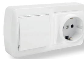
MUR63U. Socket + 2-way switch. MUR96U. With crossover switch.