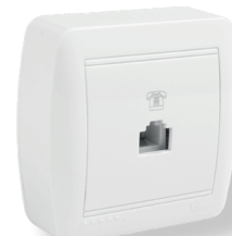
MUR84U. Telephone connector. RJ11.