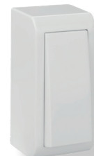
MUR02/2U. 2-way switch. MUR03/2U. Light push button.