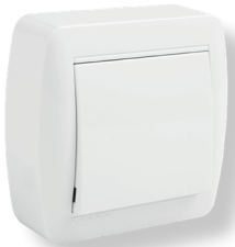
MUR02U. 2-way switch. MUR22U. 2-pole switch