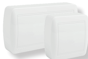
MUR62U. Junction box. MUR64U. Double junction box.