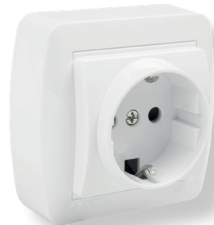
MUR60U. Socket 2P+E.