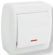
MUR021LU. Lighted 2-way switch.