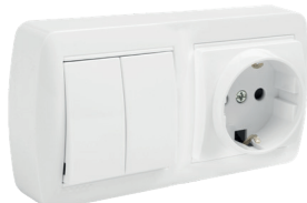
MUR36U. Socket + double 2-way switch.