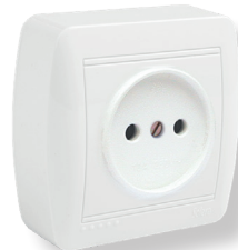
MUR07U*. Socket 2P.