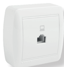
MUR88U. Data connector RJ45. MUR87U. Data connector RJ45. Cat 6.