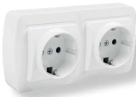
MUR66U. Double socket 2P+E.